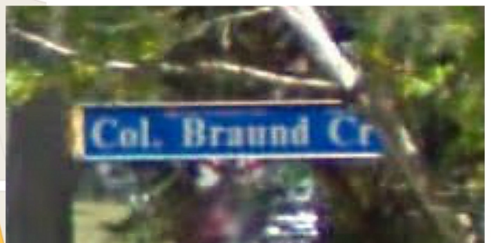
Colonel Braund Crescent Daceyville NSW 2032